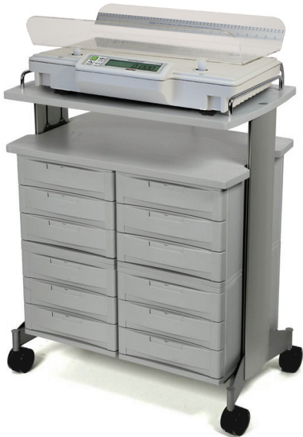
Optional cart allows portability and storage.