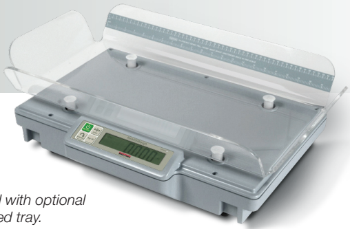
Pictured with optional four-sided tray.