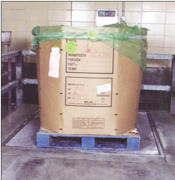
The Aegis Lift Deck is designed to handle high volumes and heavy loads.