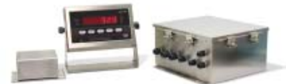
320IS indicator shown with the IS-EPS-100-240 VAC Power Supply and I/O Module (cables required not shown)